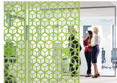
MUTO Divider Panels