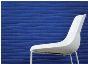
MUTO Texture Panels