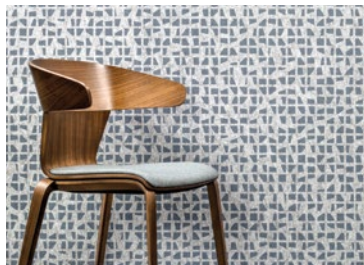
MUTO Print Panels