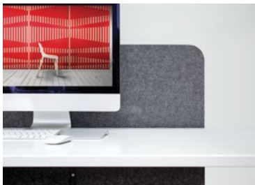
MUTO Desk Dividers