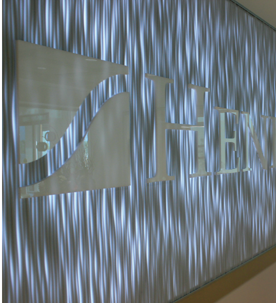
Corda in Metal Grey