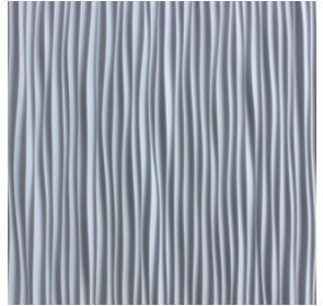
Corda in Metal Grey