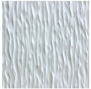
Acqua in Neo White